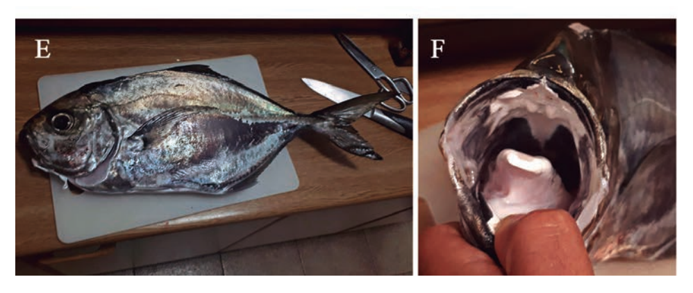
Figure 2.- A: Holacanthus africanus; B: Lutjanus griseus; C: Cirrhitus atlanticus; D: Chromis multilineata; E: Uraspis secunda; F: Interior of the mouth of Uraspis secunda.