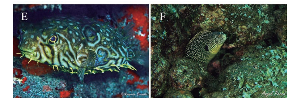
Figure 1.- A : Mycteroperca tigris ; B : Epinephelus fasciatus ; C : Epinephelus adscensionis ; D : Cephalopholis nigri ; E : Chilomycterus spinosus mauretanicus ; F : Muraena melanotis .